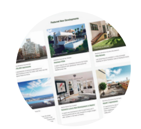
Sales and listings training