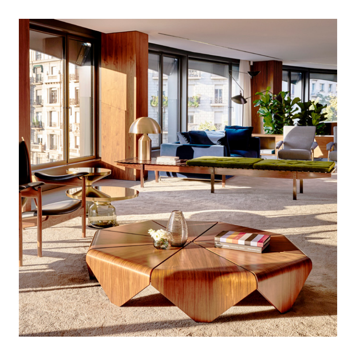
BCN17552, Barcelona SOLD FOR: € 8,000,000