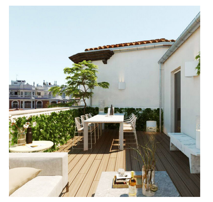
MAD16859, Madrid SOLD FOR: € 2,000,000