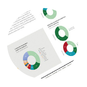
Mission, core values and key policies

Lucas Fox offers unrivalled intensive training for all new agents and Affiliates