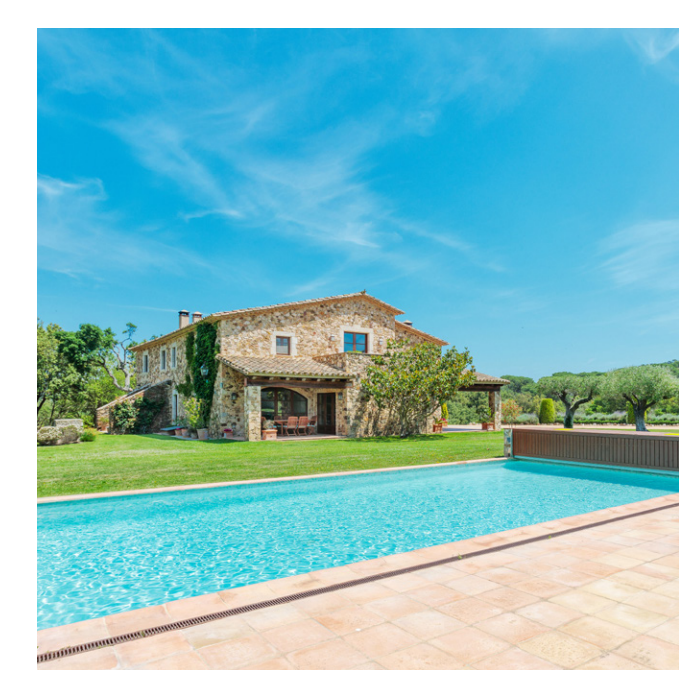
CBR11393, Girona SOLD FOR: € 3,800,000