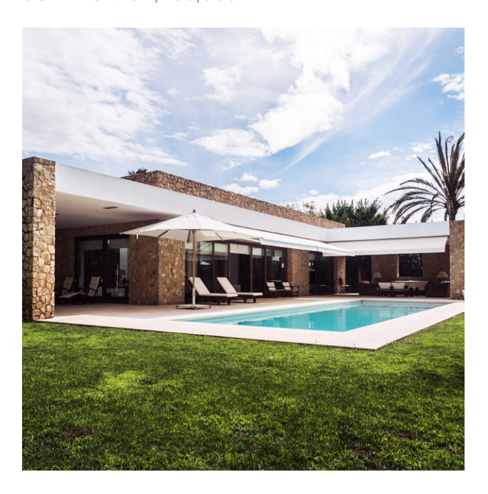
LFV1211, Valencia SOLD FOR: € 1,700,000