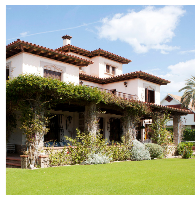
LFS2639, Sitges SOLD FOR: € 2,250,000