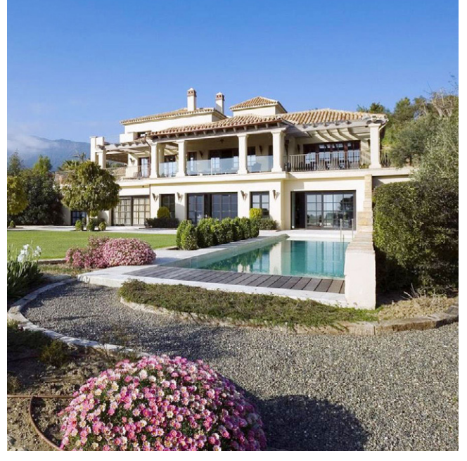
MRB16048, Marbella SOLD FOR: € 3,300,000