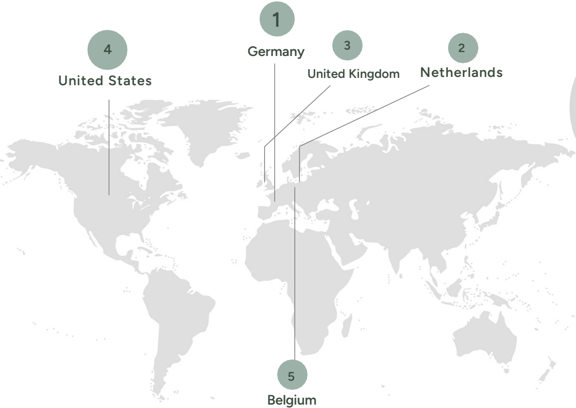
LUCAS FOX BALEARICS BUYER NATIONALITIES