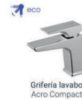
Grifería lavabo Acro Compact