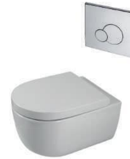
Inodoro suspendido Acro Compact Pulsador Eclipse