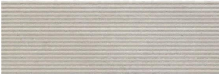
Deco Lamu 33,3 x 100 cm