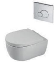
Inodoro suspendido Acro Compact Pulsador Eclipse