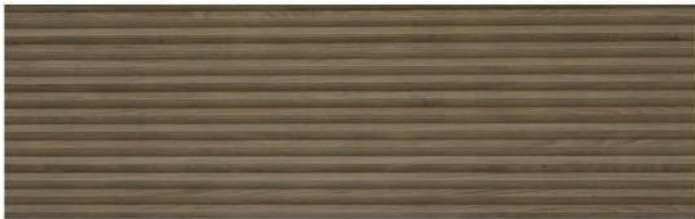
Deco Bremen Roble Natural 33,3 x 100 cm