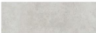
Vela Smoked 33,3 x 100 cm