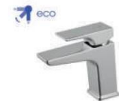
Grifería lavabo Acro Compact