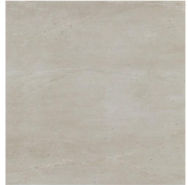
Urban Acero Nature 100 x 100 cm