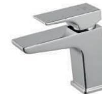
Grifería lavabo Acro Compact