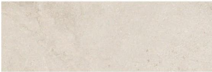
Lamu Caliza 33,3 x 100 cm