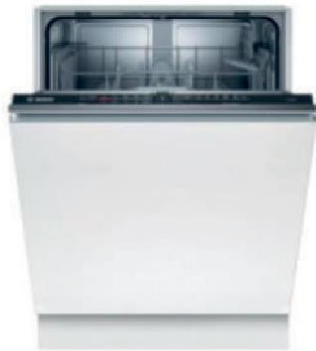
LAVAVAJILLAS BOSCH SMV2ITX18E