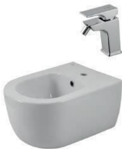
Bidé suspendido Acro Compact Grifería lavabo Acro Compact