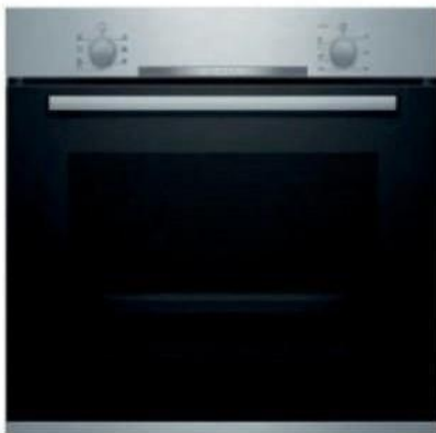
HORNO BOSCH HBA510BR0