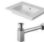
Lavabo cerámico Marne 62 cm Sifón Square