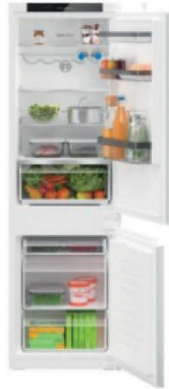
FRIGORÍFICO COMBI BOSCH KIV86VSE0