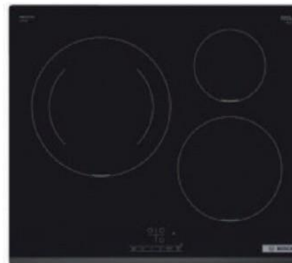
PLACA INDUC BOSCH PUJ631BB5E