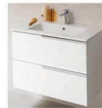
Mueble Marne N 80 Lavabo cerámico Marne N 81 cm