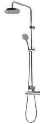
Columna ducha monomando Smart