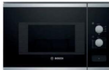
MICROONDAS BOSCH BFL520MS0