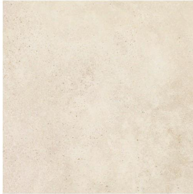
Vela Natural ant. 100 x 100 cm