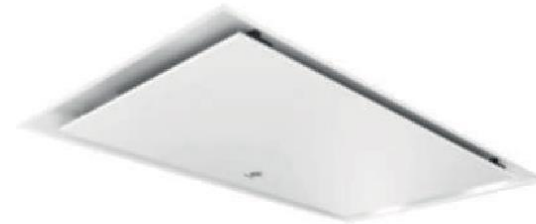
CAMPANA BALAY 3BE297RW