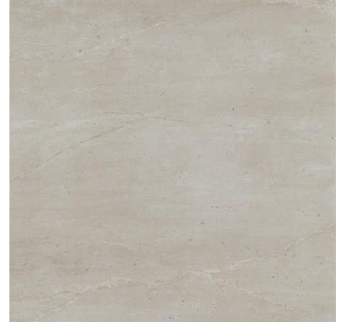
Urban Acero Nature ant. 100 x 100 cm