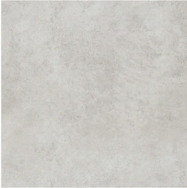
Vela Smoked ant. 100 x 100 cm