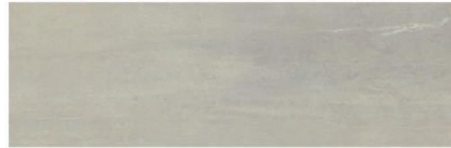
Urban Acero Nature 33,3 x 100 cm