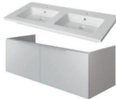
Mueble Marne N 120 Lavabo cerámico Marne N 121 cm