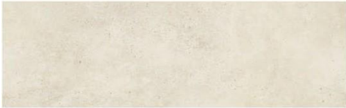
Vela Natural 33,3 x 100 cm