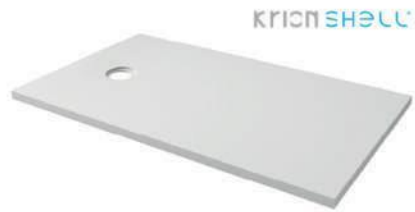
Plato ducha Flow