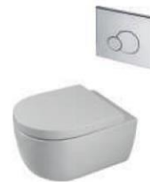
Inodoro suspendido Acro Compact Pulsador Eclipse