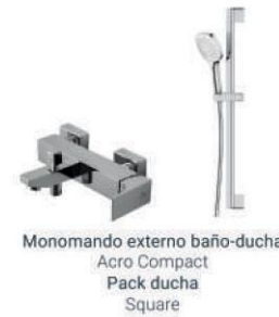
Monomando externo baño-ducha Acro Compact Pack ducha Square