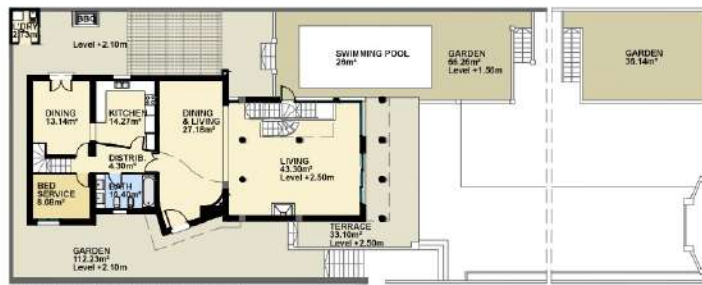
FIRST FLOOR - GARDEN - SWIMMING POOL