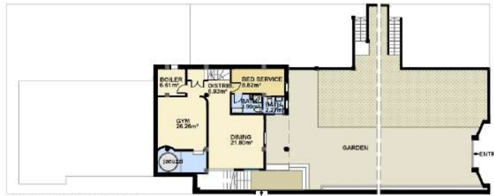
GROUND FLOOR - ENTRY - GARDEN