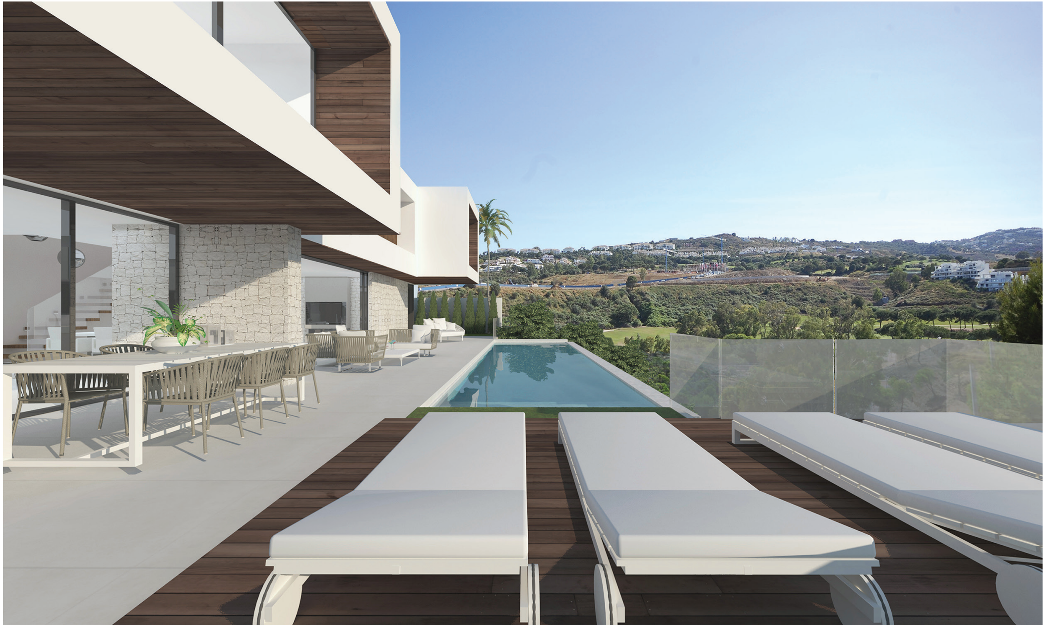
Outdoors, a sumptuous Infinity pool turns this villa into an object of desire for all those who love the sun, nature, the environment and the Mediterranean lifestyle.