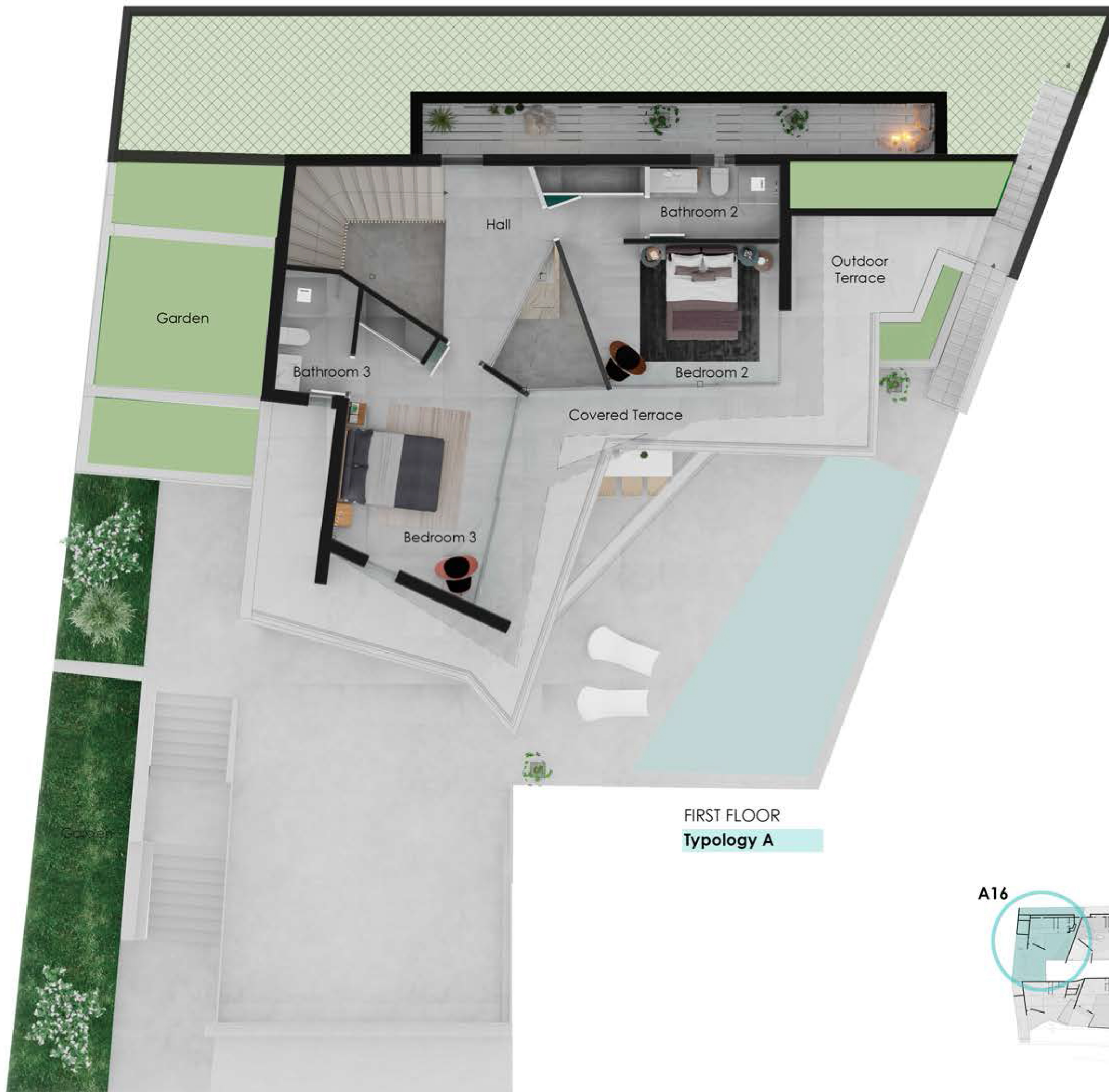
FIRST FLOOR Typology A