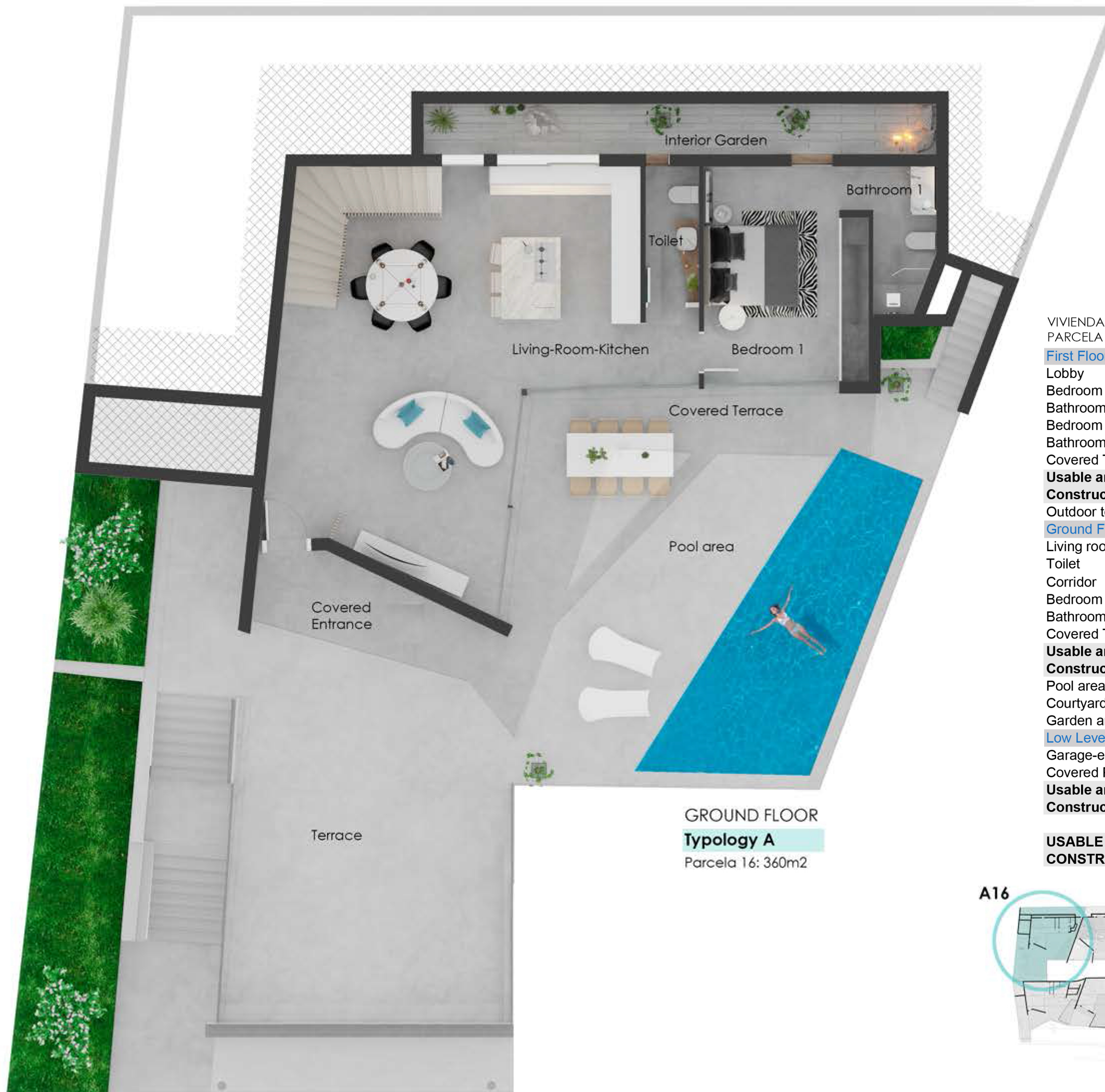
GROUND FLOOR Typology A Parcela 16: 360m 2