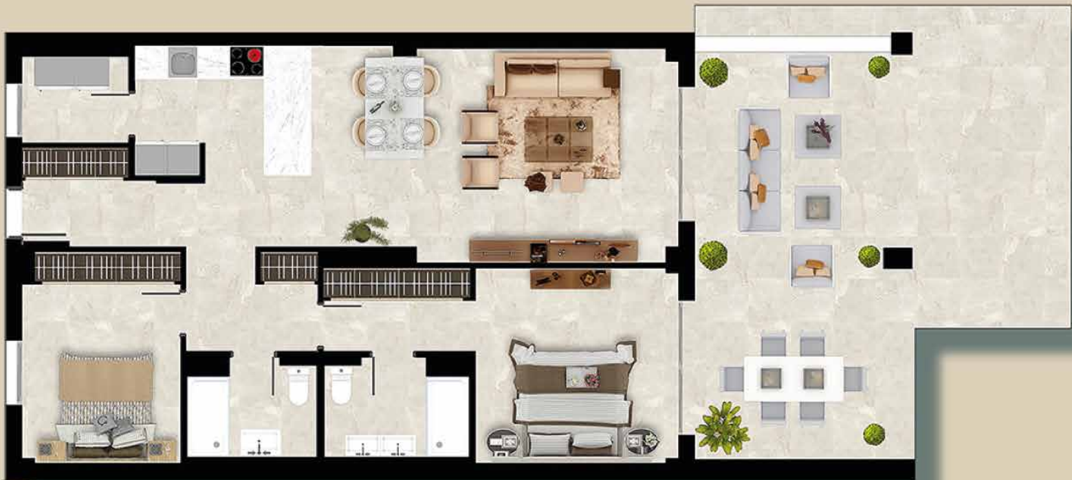
APARTMENT - 2 BED PROPERTIES