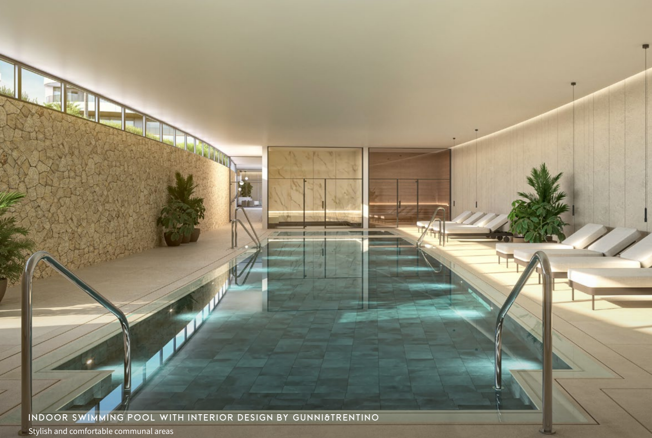
INDOOR SWIMMING POOL WITH INTERIOR DESIGN BY GUNNI&TRENTINO