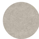
Museum grey 30x90 (Newker) Guest bathroom 1 and 2. All walls except shower wall.