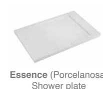
Essence (Porcelanosa) Shower plate