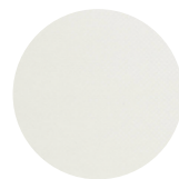
Zelda White M26/110217 (Newker) Bathroom 1 and Master Bathroom. All walls except the shower feature wall.