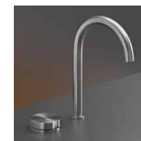
Plumb GIO21 (CEA)