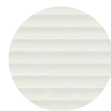
Museum Decor white 30x90 (Newker) Feature shower wall guest bathroom 1 and 2.