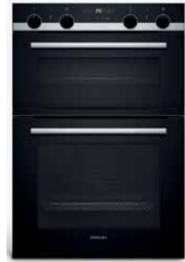
iQ500 Built-in double Stainless-steel oven