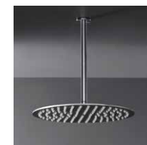
Rain shower head (CEA) FRE40