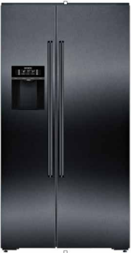
Fridge - iQ700 American fridge 177.8 x 91.2 cm Black stainless Steel