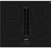
iQ300 Induction hob with integrated ventilation system 80 cm