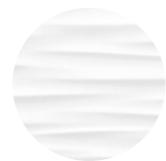
Maui ivory m28/165201 (Newker) Shower feature wall.