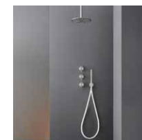
Shower hose (CEA) MIL90