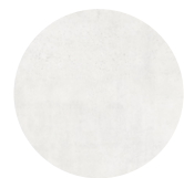
Metropolitan Caliza (Porcelanosa) 80 x 80. Ceramic Tile for exterior, interior flooring, and pool tiling.