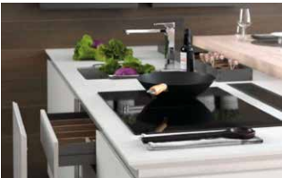
Etimoe Ice – Gris Hook Mate (Porcelanosa) Kitchen design