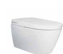
I-Comfort (Porcelanosa) WC