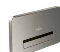
Installation system (Porcelanosa) Stainless Steel