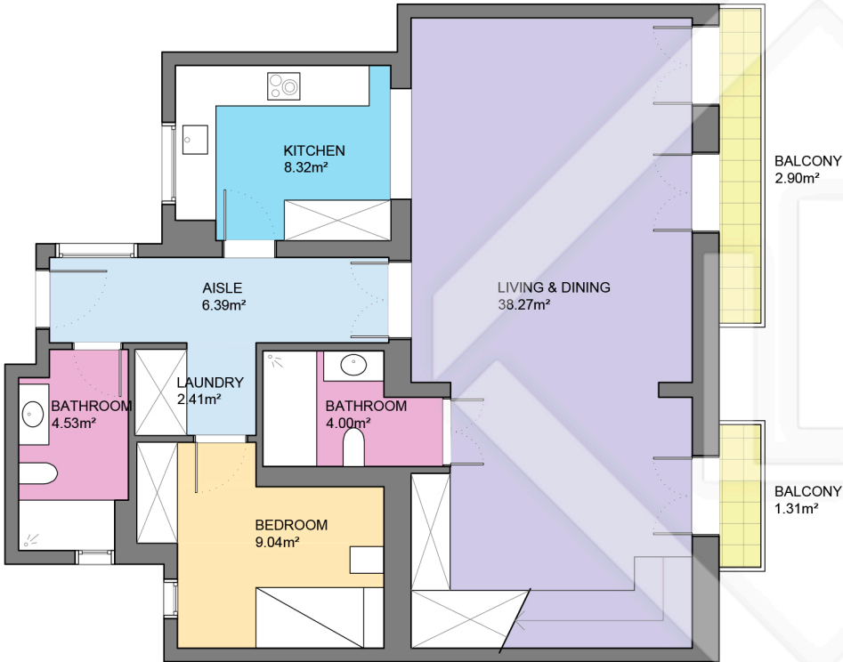
MAIN FLOOR Height = 2.78m