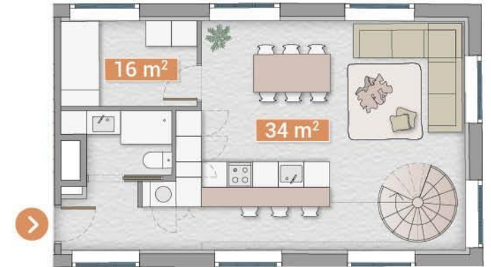
PLANTA SEGUNDA / SECOND FLOOR