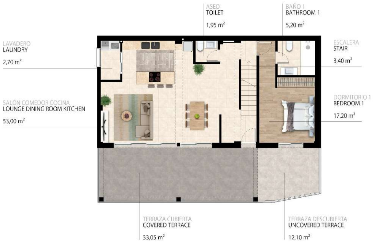
Planta baja Ground floor