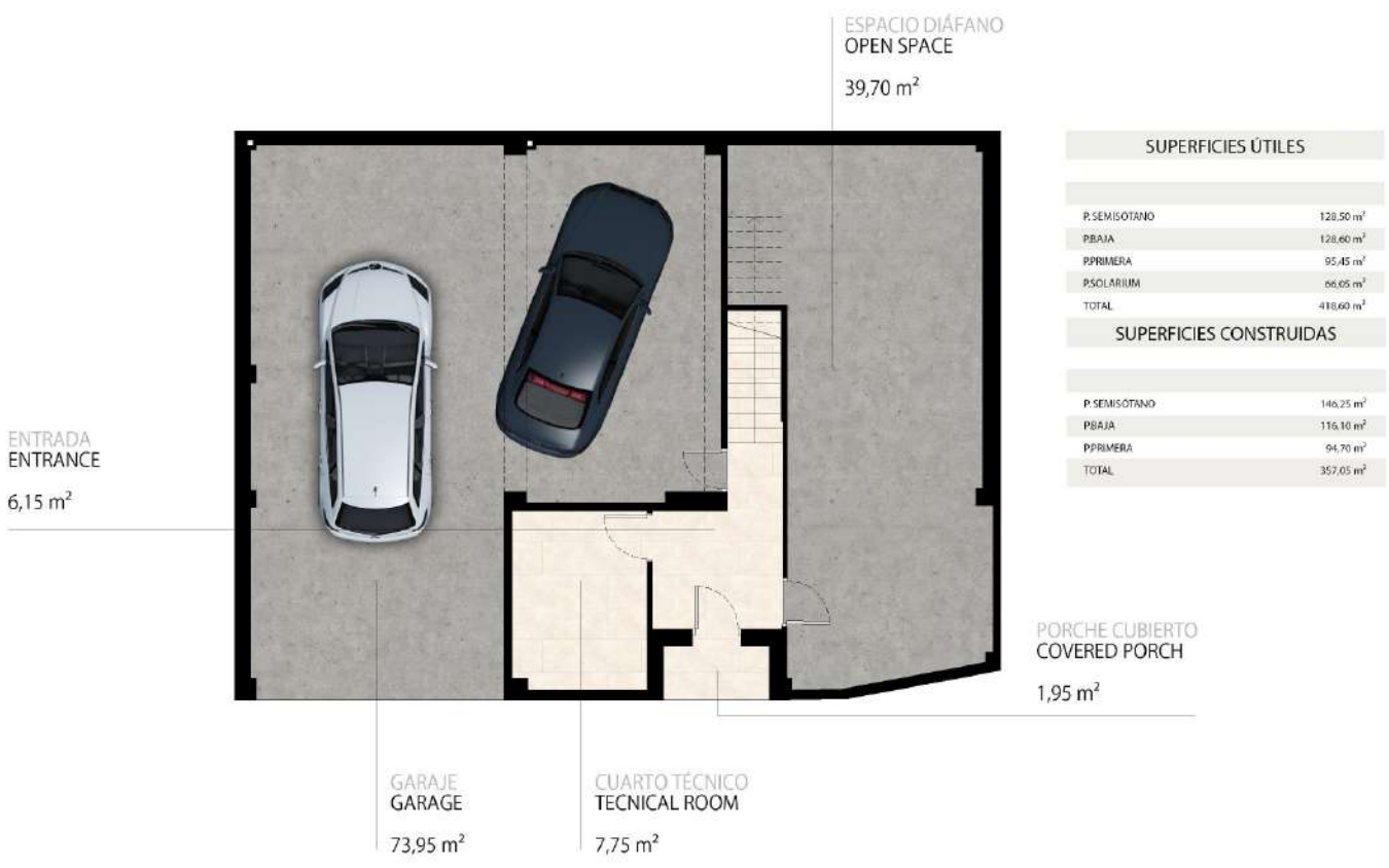
Planta Semisótano Semi-basement floor