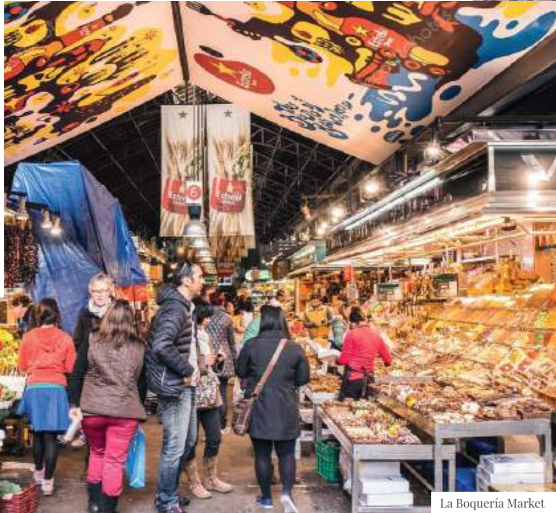
La Boquería Market