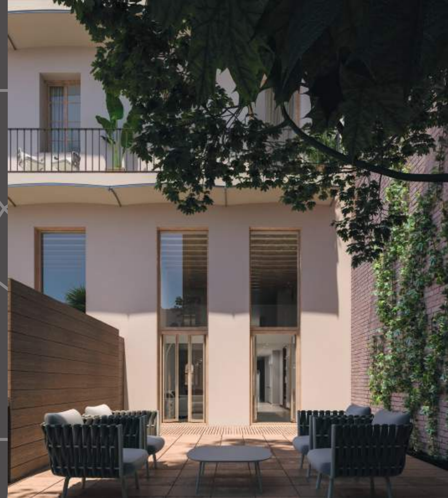
Pau Claris 130 façade

On top, two duplex penthouses with roof terraces offering sweeping views make up this exclusive residential development.