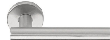
Levers (black or silver)