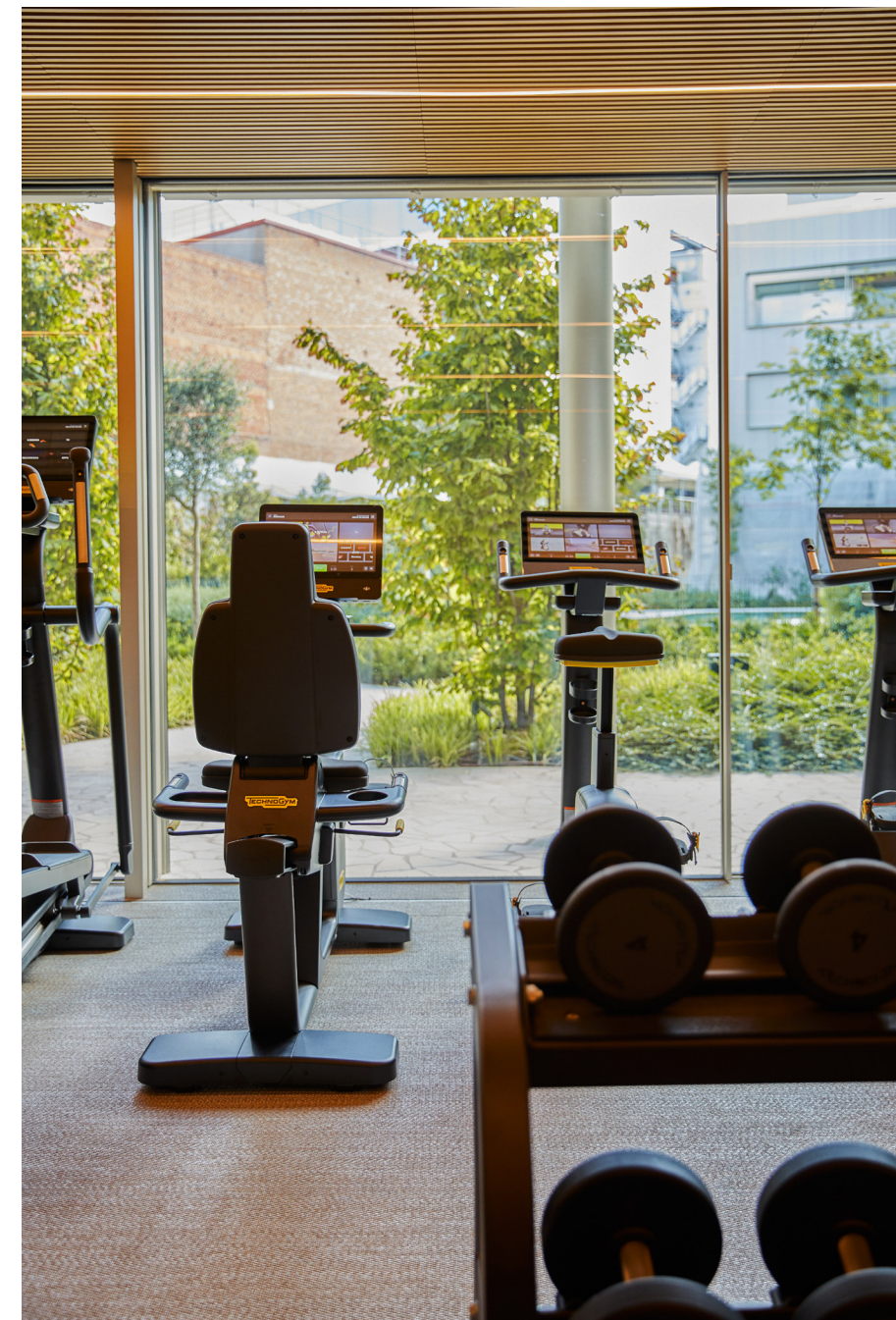
THE GLASS-FRONTED 120 SQM GYM IS EQUIPPED WITH STATE-OF-THE-ART MACHINES.