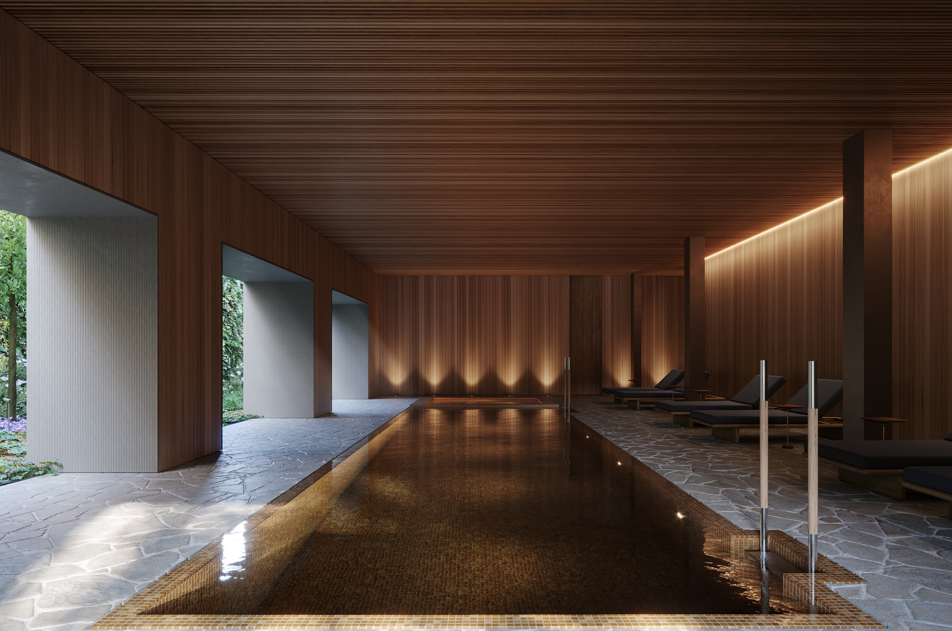
The indoor pool dimensions span 9.5 meters in length and 3.3 meters in width, featuring dual current resistance systems strategically positioned along the length of the pool to facilitate swimming against the current.