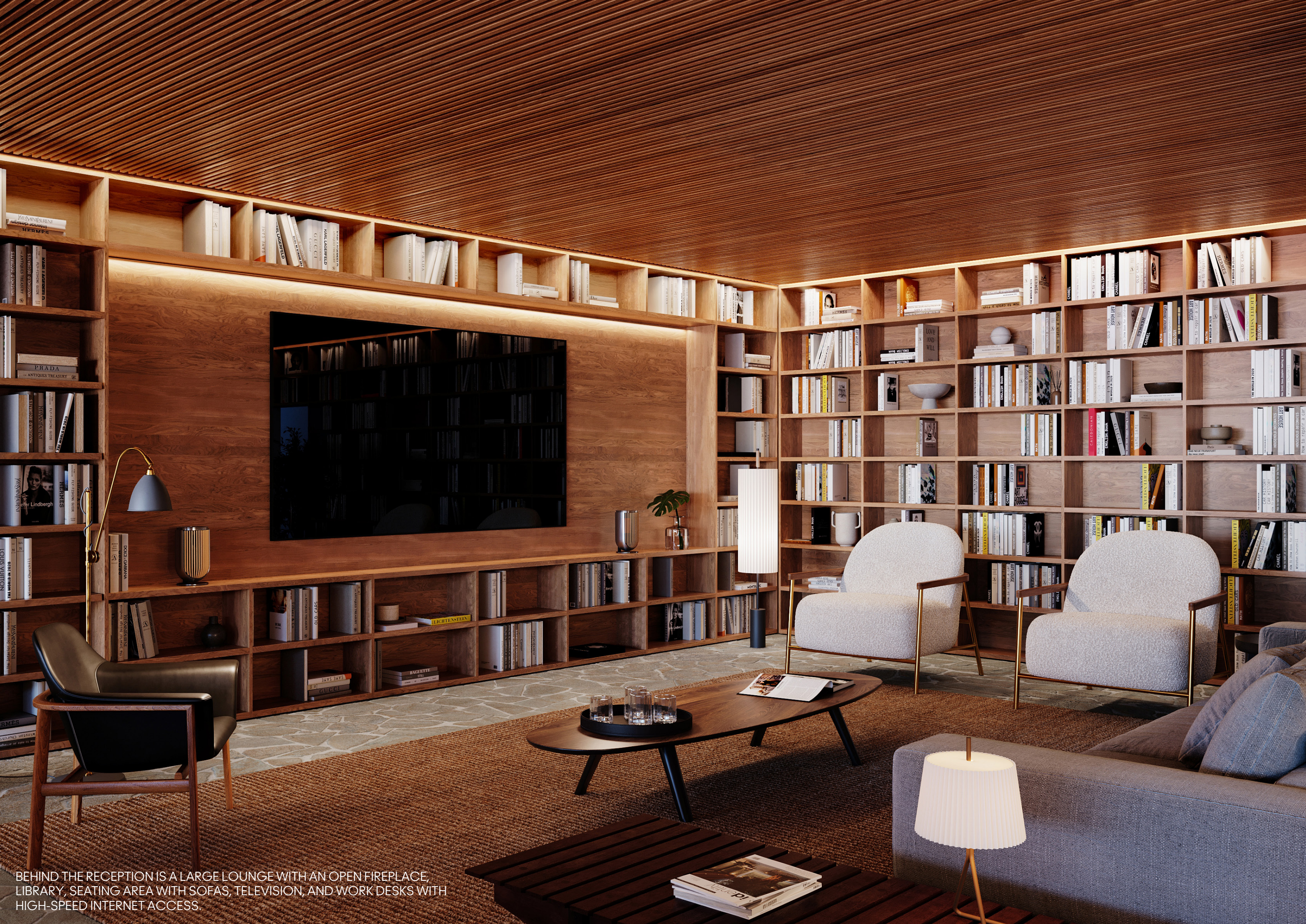
BEHIND THE RECEPTION IS A LARGE LOUNGE WITH AN OPEN FIREPLACE, LIBRARY, SEATING AREA WITH SOFAS, TELEVISION, AND WORK DESKS WITH HIGH-SPEED INTERNET ACCESS.