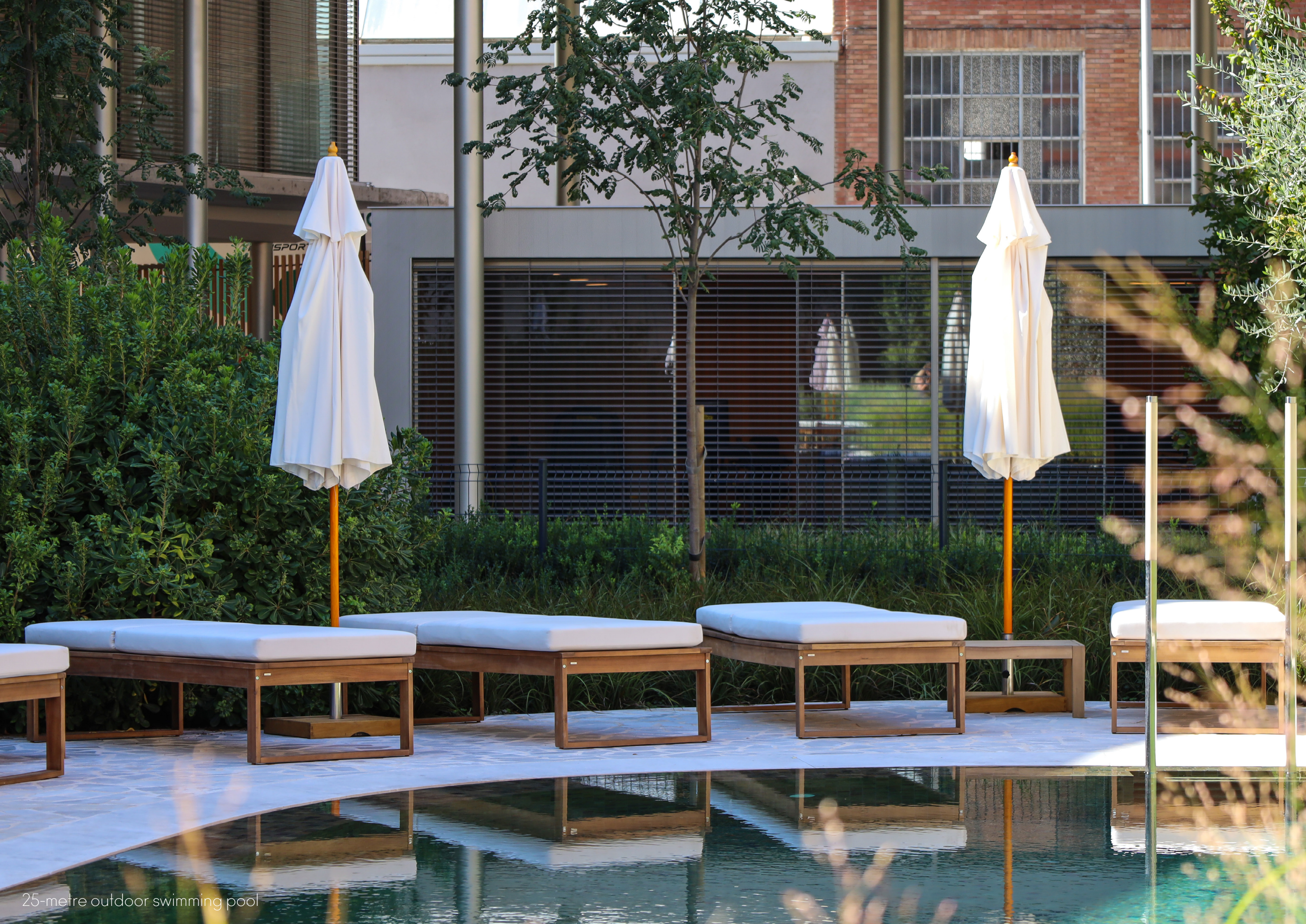
25-metre outdoor swimming pool