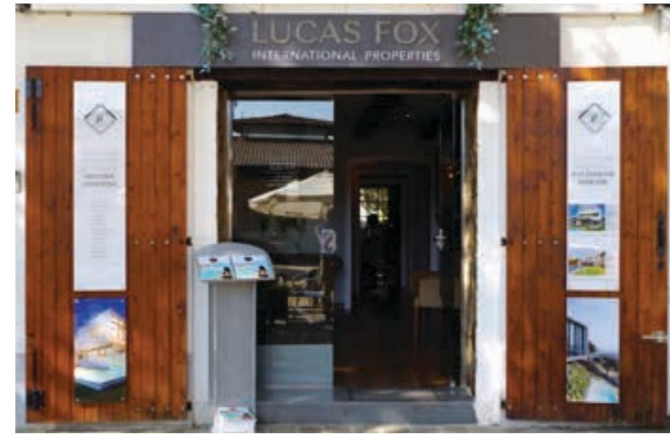
Lucas Fox Property Lounge Alella, Maresme Coast