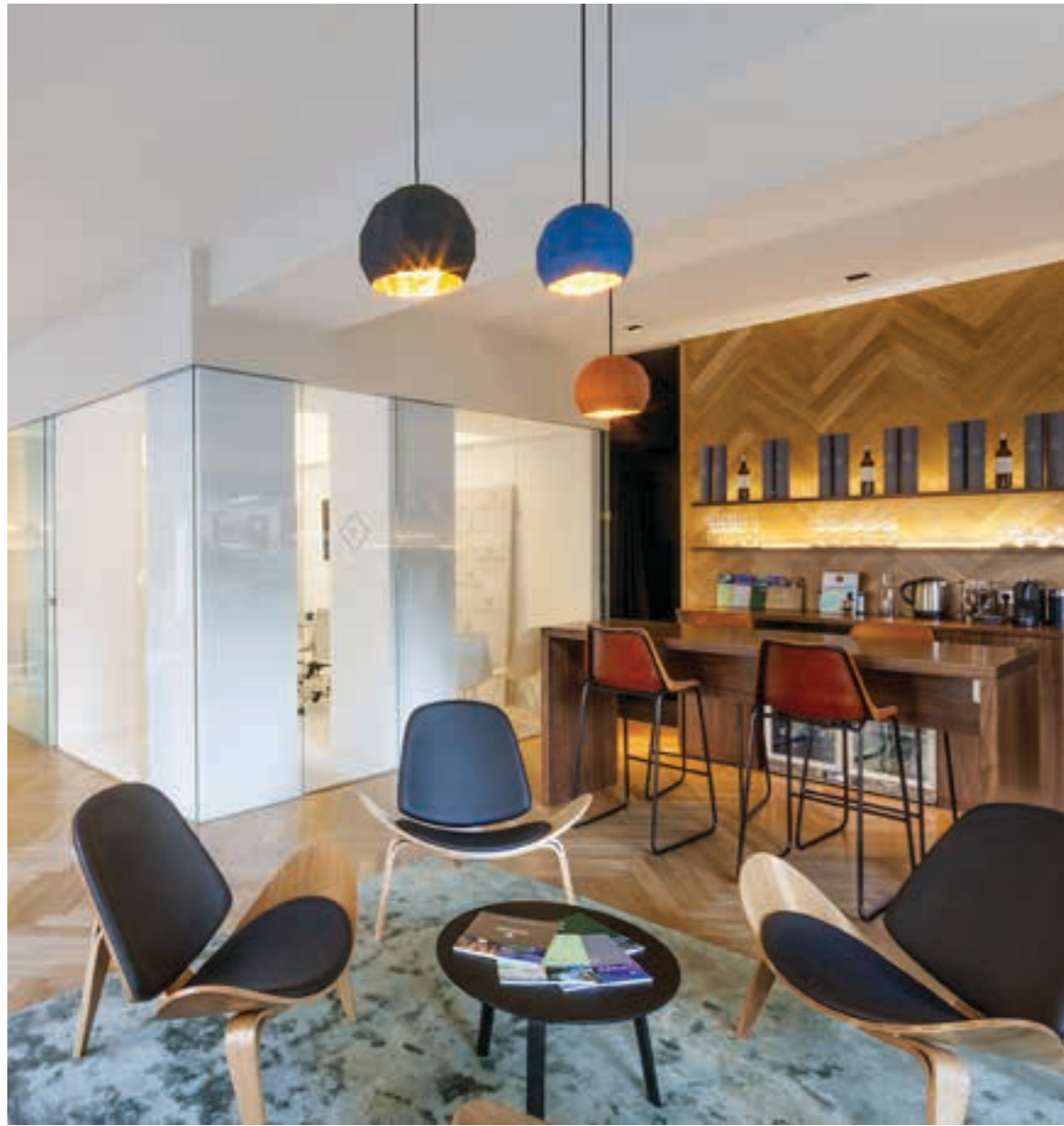
Lucas Fox Property Lounge Turó Park, Barcelona