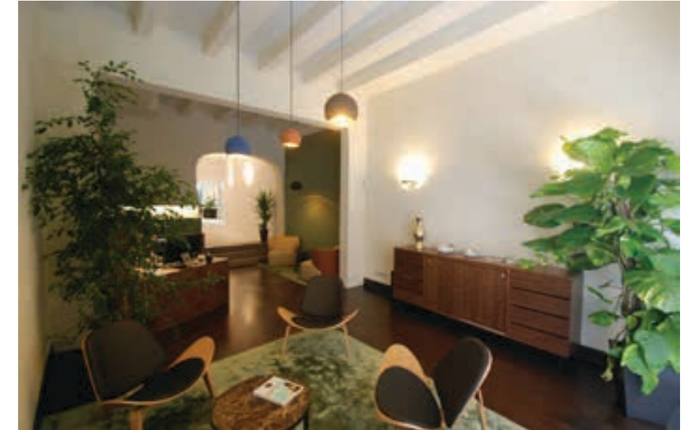
Lucas Fox Property Lounge Sitges