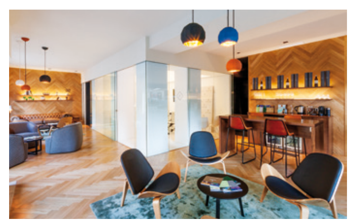
Lucas Fox Barcelona Property Lounge, Turo Park

Lucas Fox has 12 offices in 10 regions including six Property Lounges. In 2013, Lucas Fox opened the first of its Property Lounges at the company Headquarters in central Barcelona. The second Property Lounge was opened soon after in the market town of Alella on the Maresme Coast, 2014 saw the launch of two further Lounges - in the cosmopolitan Catalan town of Sitges and in the upmarket Barcelona district of Turó Park. In 2015, new Property Lounges were inaugurated in the medieval town of Begur on the Costa Brava and Marbella.