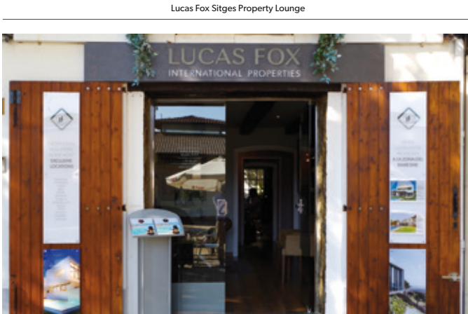
Lucas Fox Maresme Property Lounge, Alella