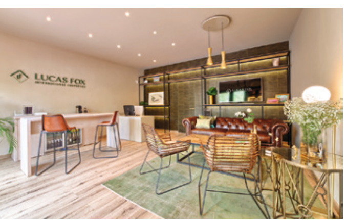
Lucas Fox Marbella Property Lounge