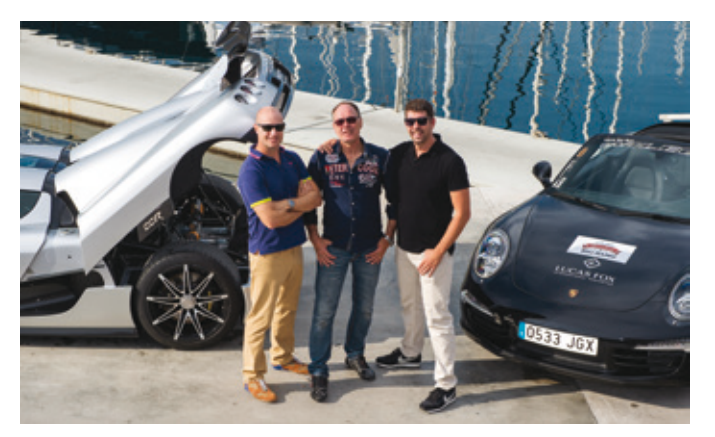
In 2015, Lucas Fox was premium sponsor at the Barcelona Big Bang, a glamorous 6-day supercar event attracting some of Europe's wealthiest businessmen and entrepreneurs.

In 2014, Lucas Fox launched a new brand and online magazine LFStyle (www.lucasfoxstyle.com) in response to the growing demand from international clients wishing to learn more about Spain's numerous lifestyle and cultural benefits. The blog includes insiders' guides, interviews, destination guides, relocation stories, restaurant reviews and much more. It has become a go-to point of reference for overseas buyers looking to purchase property in Spain's most desirable second-home destinations.